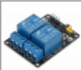
Multi-channel optocoupled relay module (HL-54, HW-316, KY-019, HFD4/3-S, FY-T734)