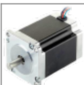
NEMA units & drivers \\ (A4988, DRV8825, TMC2208, TMC2209, TMC2225, TMC2240, TB6600, DM556, DM542, DM860, DM860H)